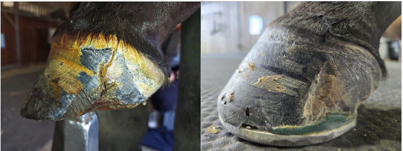
XXXXXX R FR MED HOOF 31 ST OCT 24

The colt presented sound with no detectable digital pulse and no capsular heat.