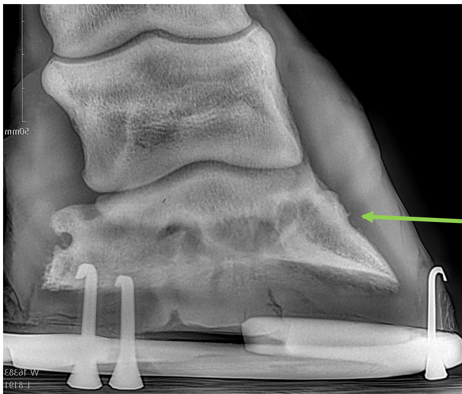
XXXXXX R FR DP 35 DEG 19 TH DEC 24