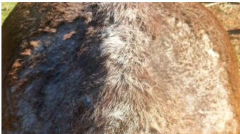
PENNY 16 TH SEP 23