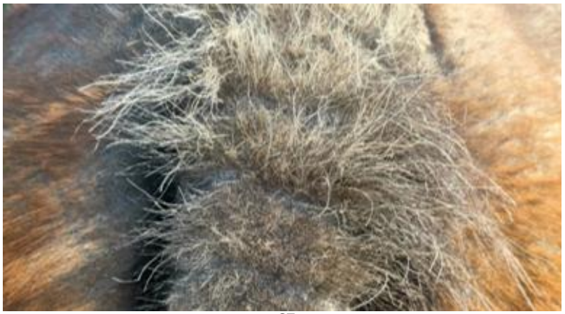
HERO 31<sup>ST</sup> AUG 23