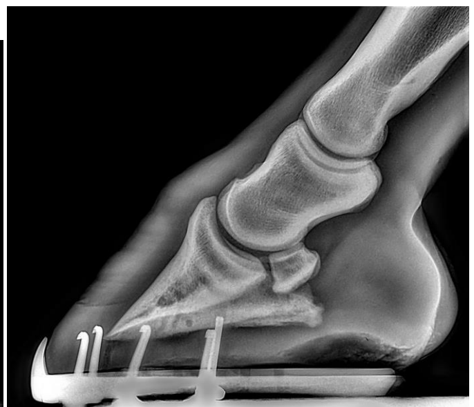
26 TH MAY 2021

Radiographs on the 25 th Feb 21 clearly show a rotated P3 with an air pocket continuous from the sole to the ventral extremity of the Pedal bone and approximately 4mm of sole depth despite ventral capsular rupture.